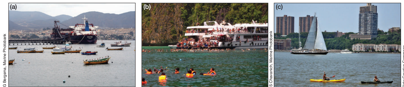
Figure 1. Human uses of the ocean can have multiple dimensions that need to be considered in ecosystem-based ocean planning. (a) Human activities can operate at different scales in a planning region, with large, industrial shipping industries operating in the same ocean space as artisanal fishing fleets. (b) Human uses can also vary in their intensity in a planning region, including seasonal variations as illustrated by summertime dive tourism. (c) Some uses may be compatible, such as kayaking and recreational sailing, while others may not, requiring creative planning solutions to mitigate potential conflicts.

uses and activities. For example, locating marine reserves in close proximity to areas accessed by recreational users (eg kayaking, SCUBA diving, and shore-based wildlife viewing) may simultaneously enhance the conservation goals of reserves by increasing compliance monitoring while improving wildlife viewing opportunities for recreational users.