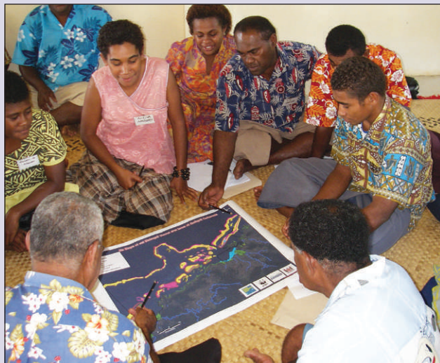
In Fiji, community managers work with user-derived data to consider new no-take areas in traditionally managed fisheries.